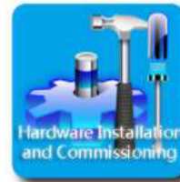
Hardware Networking Installation and Commissioning