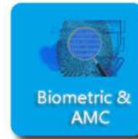
Biometrics Installation and AMC