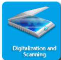
Digitalization, Printing and Scanning