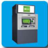
ATM Installation and AMC